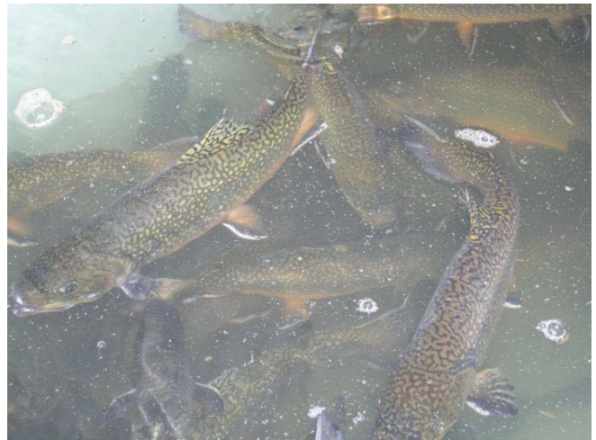
(Above) Brighter in color, these are the adult male brook trout before we collected their milt.

On September 28, 2011 , members of the PA Fish & Boat Commission's Benner Spring Hatchery began to "spawn" our brook trout eggs. These pictures above are of the native brook trout spawning and the pictures below are of the little brook trout eggs just after they were collected from the female brook trout and mixed with the milt of the male.