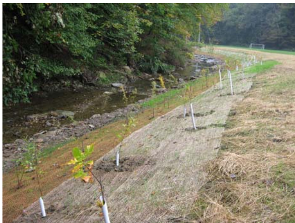
(LEFT) Riparian Planting Along the Bank

PWWTU will meet with the PA Fish & Boat Commission to discuss the feasibility of stocking this section as a children's fishing area.