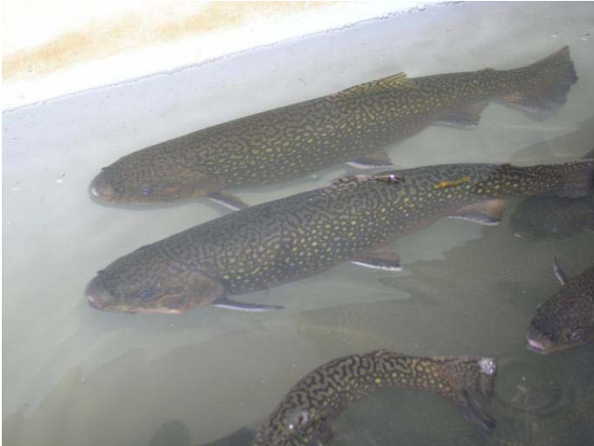
(Above) Adult female brook trout in preparation tank.